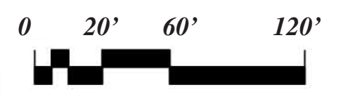
Scale: 1 inch equals 60 feet